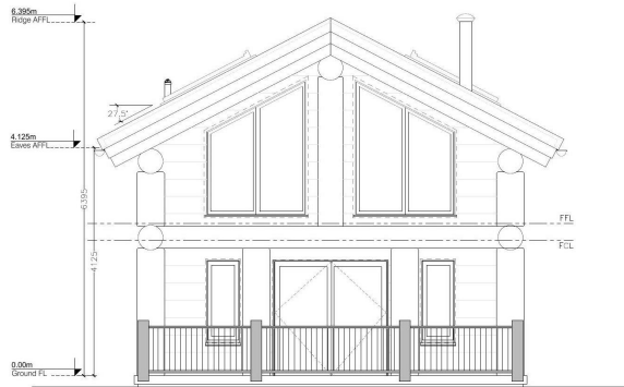
SOUTH ELEVATION (POND)

THIS DRAWING IS COPYRIGHT ©. USE FIGURED DIMENSIONS ONLY. ALL DIMENSIONS TO BE CHECKED ON SITE BEFORE WORK COMMENCES. DISCREPANCIES TO BE REPORTED TO CALDONIA LOG HOMES. VARIATIONS AND MODIFICATIONS TO INFORMATION SHOWN ON THIS DRAWING SHALL NOT BE CARRIED OUT WITHOUT THE WRITTEN PERMISSION OF CALDONIA LOG HOMES. WHO ACCEPTS NO LIABILITY FOR ALTERATIONS MADE TO THIS DRAWING BY ANY OTHER PARTY. THIS DRAWING IS TO BE READ IN CONJUNCTION WITH ALL RELEVANT ARCHITECTURAL, STRUCTURAL, SERVICES DRAWINGS AND SPECIFICATIONS.