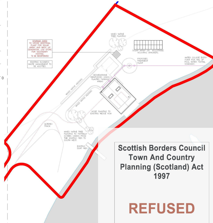
SITE PLAN SCALE 1:250

Scottish Borders Council Town And Country Planning (Scotland) Act 1997